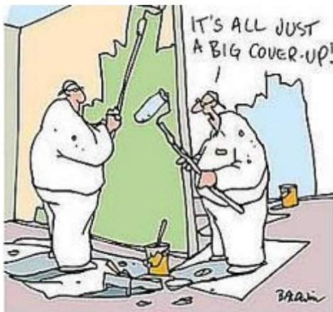
Never discuss politics with painters.

Would you like to offer your skills, enthusiasm and plain old muscle-power to help actually make The Melting Pot?